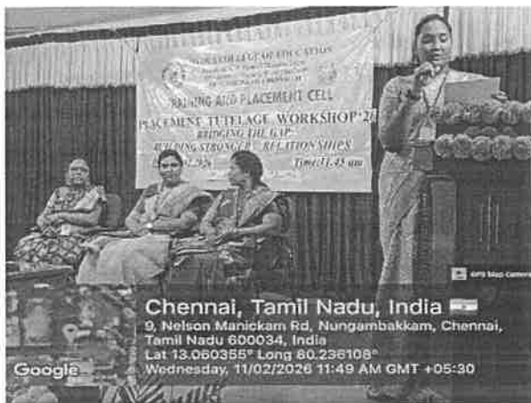
Chennai, Tamil Nadu, India 9, Nelson Manickam Rd, Nungambakkam, Chennai, Tamil Nadu 600034, India Lat 13.060355° Long 80.236108° Wednesday, 11/02/2026 11:49 AM GMT +05:30