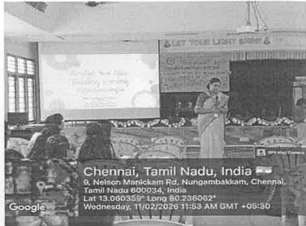
Chennai, Tamil Nadu, India 9, Nelson Manickam Rd, Nungambakkam, Chennai, Tamil Nadu 600034, India Lat 13.060359° Long 80.236052° Wednesday, 11/02/2026 11:53 AM GMT +05:30