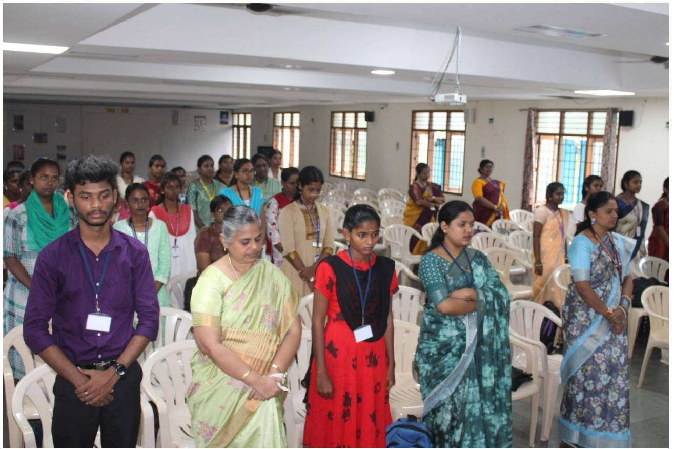
TAMIL THAI VAZHTHU