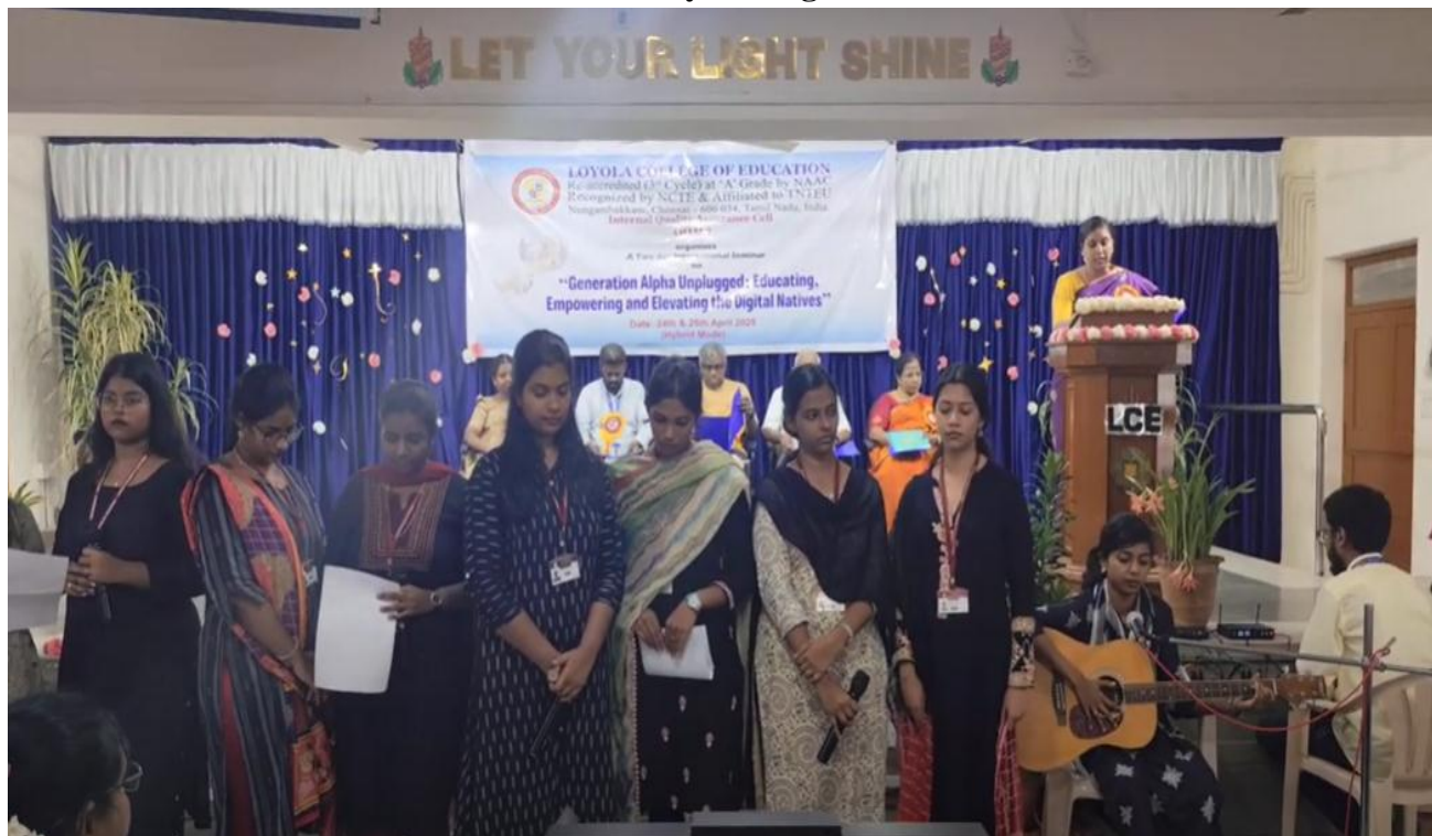
Lighting of the lamp