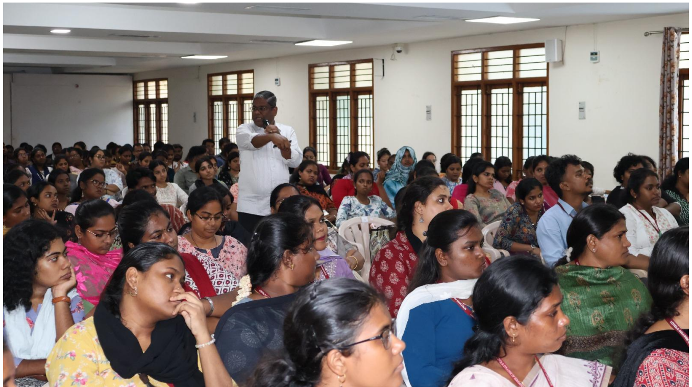
INTERACTION BY STUDENT TEACHERS