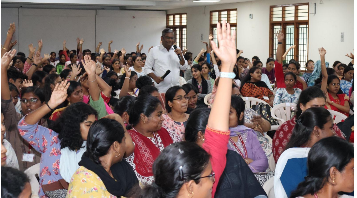
COMMITTEE MEMBERS OF ELECTORAL LITERACY CLUB ALONGWITH RESOURCE PERSON